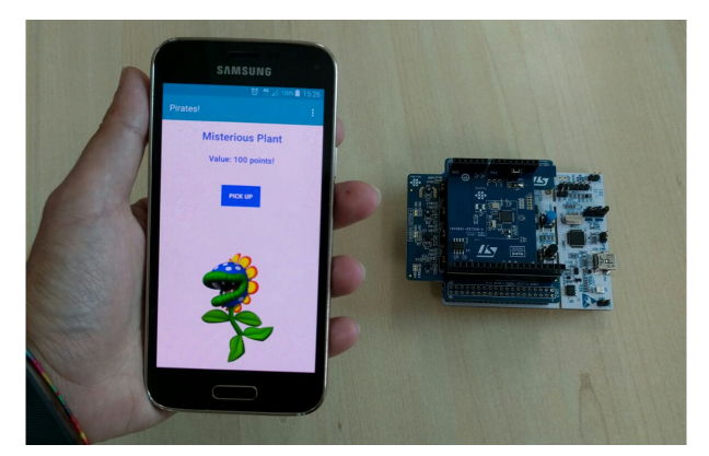
Fig. 3. User interface on a person's smartphone and environment-immersed sensor device in our pervasive game.